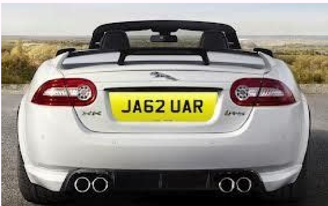
Transferring personalised number plates. Transfer ownership of a personalised number plate. How much does it cost to transfer personalised number plates. Transferring ownership of personalised plates. Changing number plate to personalised.